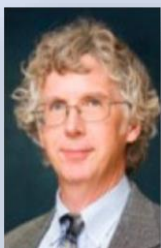
James F. Campbell Professor of Supply Chain & Analytics